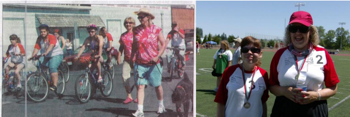
Special Olympians from Eastern Oregon compete in two states

Although 55 new people have been enrolled, the net increase is only 24 people because 31 people moved out for the reasons indicated in the chart to the left. As of June 30, 2008, there are six vacancies caused by people exiting the brokerage that are waiting to be back filled.