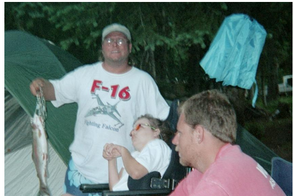
Umatilla County Local Alliance members enjoy an annual camping trip

Local Alliances: In addition to the annual meeting and Board of Directors described above, the membership has the opportunity to work together to plan and develop local service delivery expansion, as well as to advise the Board of Directors through regular regional meetings. These Local Alliances are made up of members of the organization in the region, and just like the membership and the board of directors, are composed of a majority of families and self-advocates. Personal Agents from the region act as support staff to facilitate