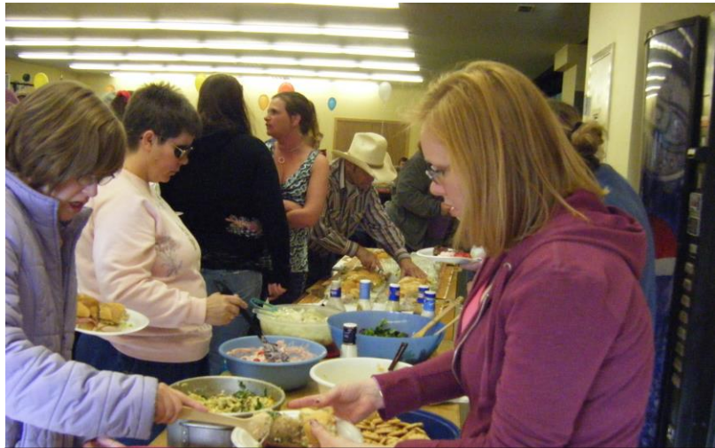
Baker County Local Alliance members enjoy a monthly pot luck luncheon

Responsibility: People with disabilities will have the opportunity to accept a valued role in a their community through competitive employment, organization affiliation, spiritual development and general caring for others in the community, as well as accountability for spending public dollars in ways that are life enhancing.